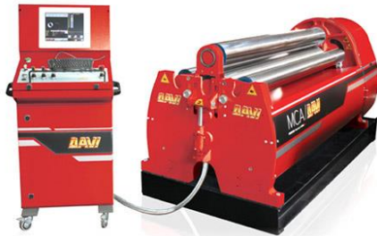
Plate Bending Facility